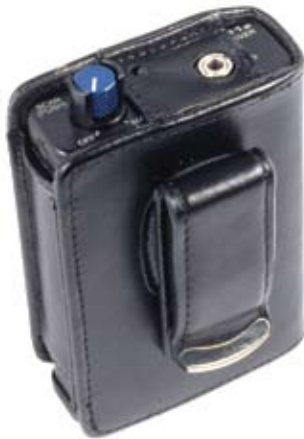
The R1a comes with a protective leather pouch with an integrated belt clip.

The incoming RF signal is filtered and amplified, then mixed down to the IF frequency with a microprocessor controlled synthesizer. A pilot tone squelch system is used to keep the receiver silent when no carrier is present. The pilot tone signal is on a different frequency than Lectrosonics UHF wireless microphone systems to prevent interference when the systems are used in the same location. The audio signal processing includes compressor noise reduction for low noise and excellent intelligibility.