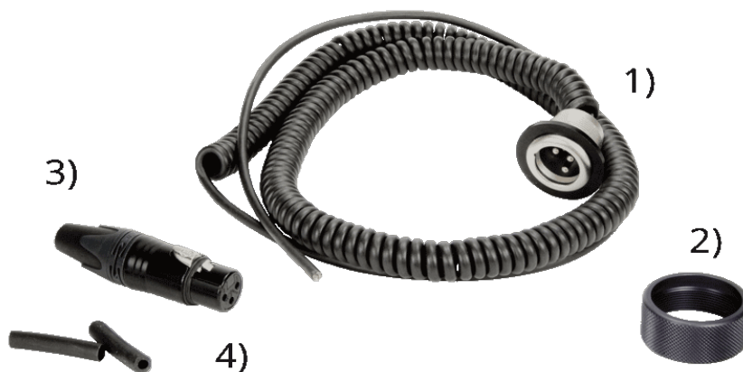
Assembled coiled cable kit (mono wiring QXCCMI-80)