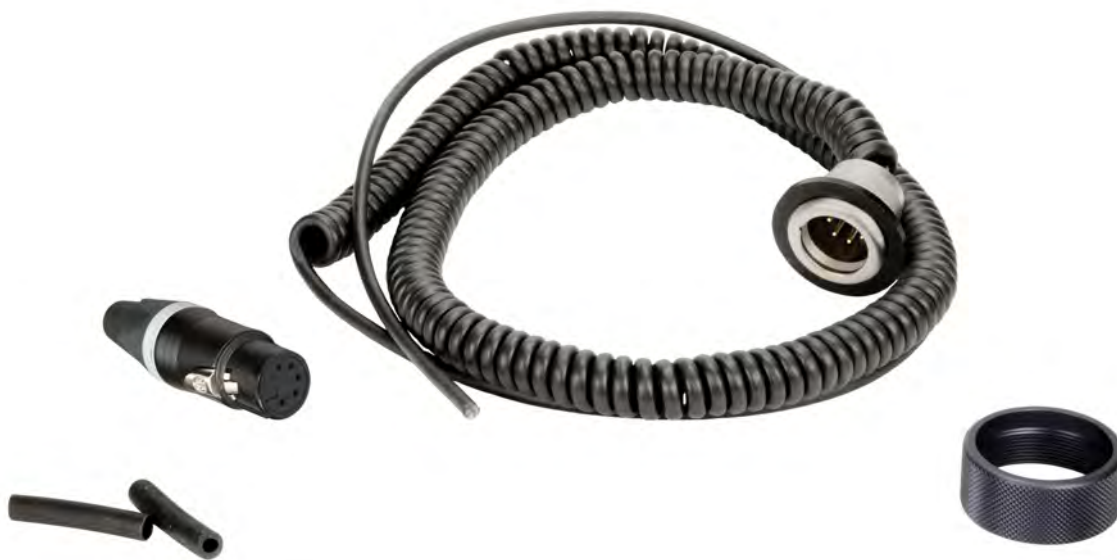
Assembled coiled cable kit (stereo wiring QXCCSI-80)